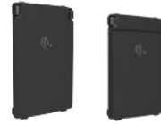
Batteries (3300 mAh, 5260 mAh)