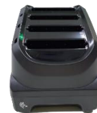
4-slot Battery Charger