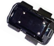
Wearable Arm Mount