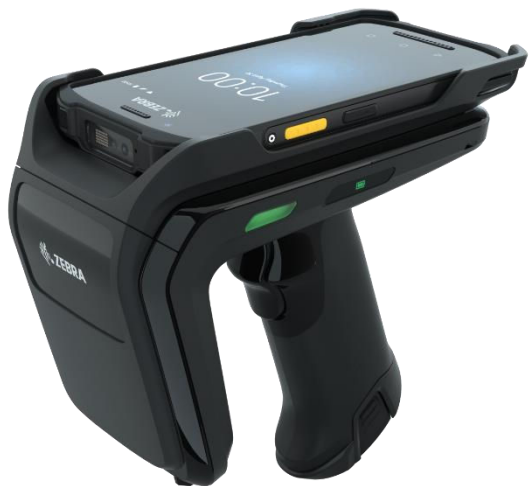
RFD40 RFID Sled See table for part numbers