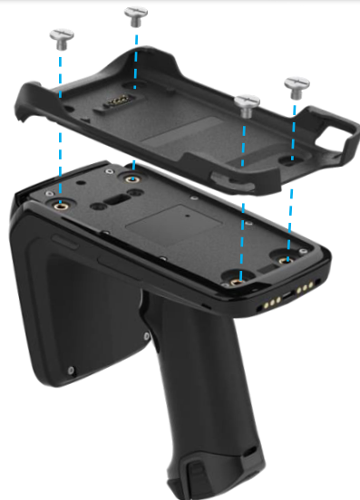
TC21/26 Sled Adaptor ADP-RFD40-TC2X-1E